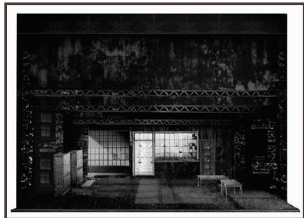
Clockwise from top: Renderings of the tenement surround, locker room, and Tom Moody's office.